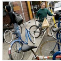
In Portland, Cultivating a Culture of Two Wheels