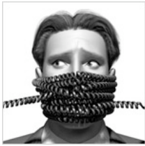
Op-Ed: John Ashcroft on the Telecom Lawsuits