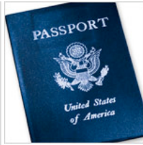
Study Abroad Becomes a Must-Have Credential