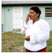
The Subprime Mortgage Race Gap