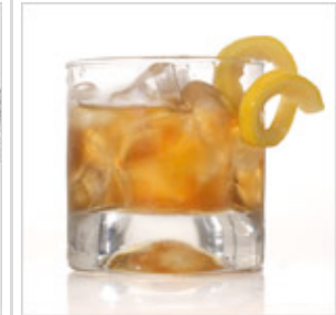
The Minimalist: Add a Splash of Ad-Lib

Home | World | U.S. | N.Y. / Region | Business | Technology | Science | Health | Sports | Opinion | Arts | Style | Travel | Jobs | Real Estate | Automobiles | Back to Top Copyright 2008 The New York Times Company | Privacy Policy | Search | Corrections | RSS | First Look | Help | Contact Us | Work for Us | Site Map