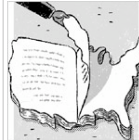
Gary Hart on America's Next Chapter