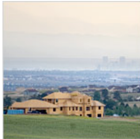
Rethinking the Country Life as Energy Costs Rise